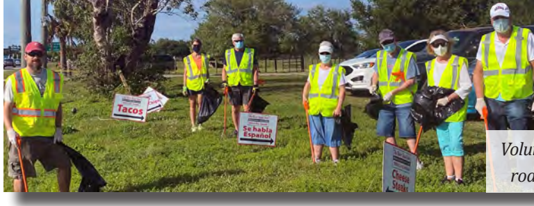
Volunteers working on our adopted road, Upper Manatee River Road.