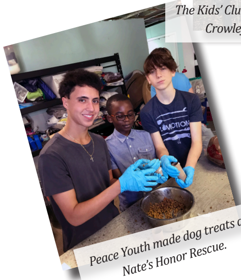
Peace Youth made dog treats at Nate's Honor Rescue.

ages and stages of life, emphasizing opportunities for fun, community-building, and spiritual growth in a beautiful, natural environment. To ensure your choice of programs, pick up a brochure in the church office or visit www.cedarkirk.org today. If you have any questions, please contact the camp office at 813.685.4224 x2 or camps@cedarkirk.org .