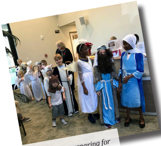
Peace children preparing for the Dec. 24 Nativity Pageant.