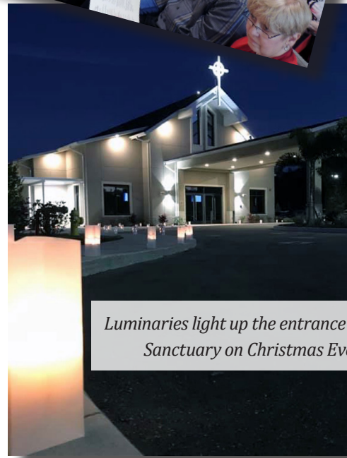
Luminaries light up the entrance to the Sanctuary on Christmas Eve.