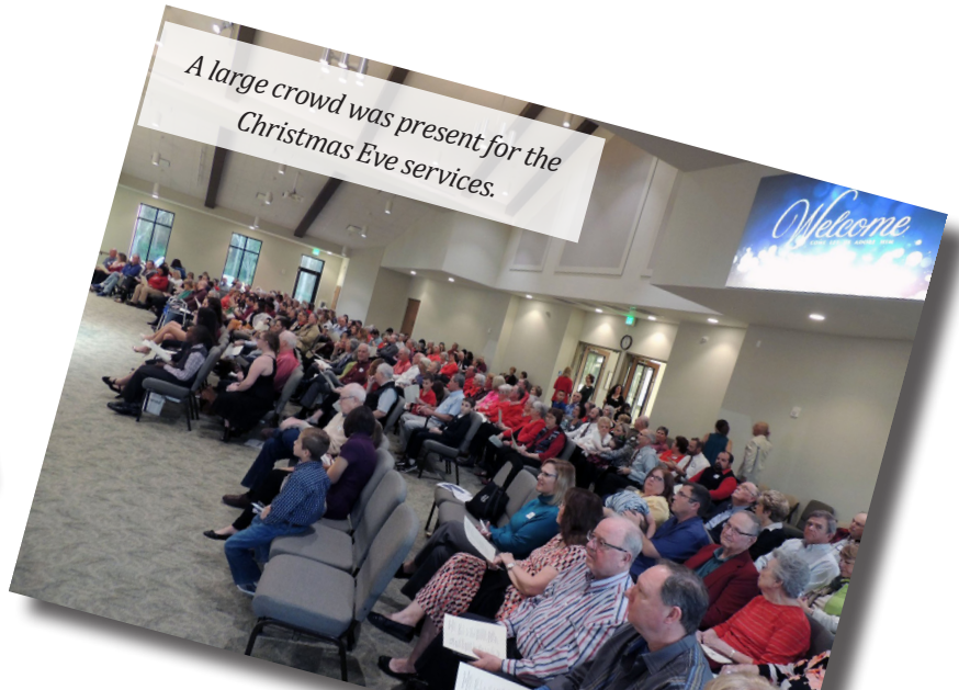
A large crowd was present for the Christmas Eve services.