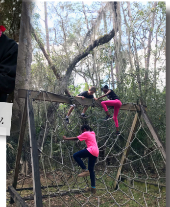
The Kids' Club made a fun trip to Crowley Nature Park.