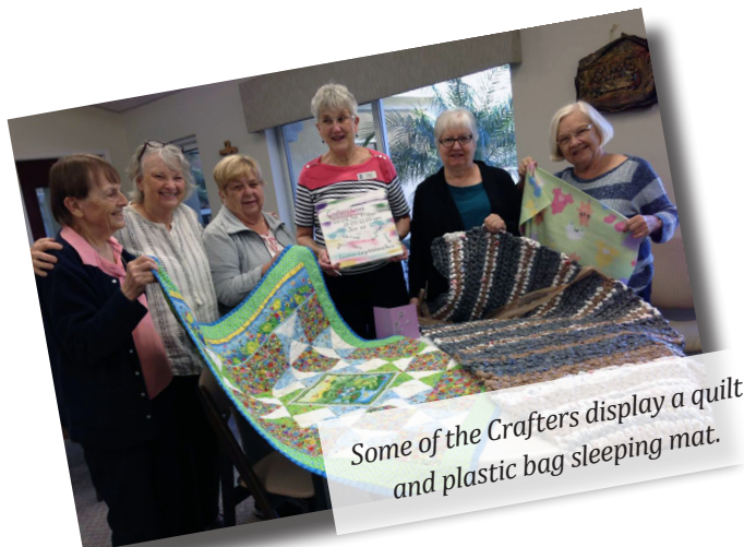
Some of the Crafters display a quilt and plastic bag sleeping mat.

We are always looking for new projects. So, if anyone wants to bring something to us, please do.