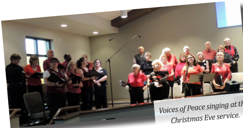
Voices of Peace singing at the Christmas Eve service.