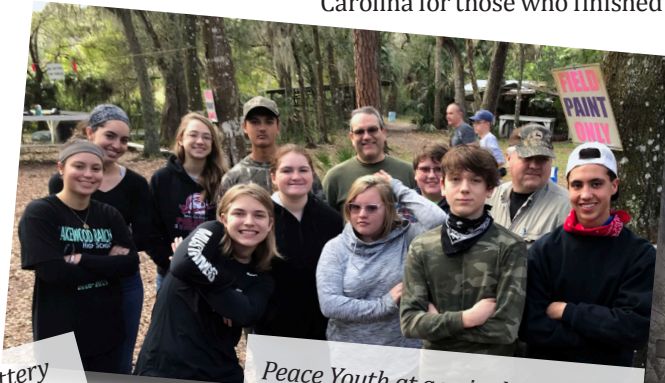
Peace Youth at a paint ball activity.