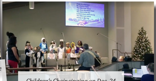
Children's Choir singing on Dec. 24.