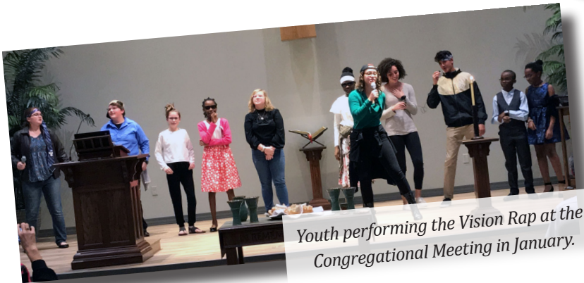
Youth performing the Vision Rap at the Congregational Meeting in January.