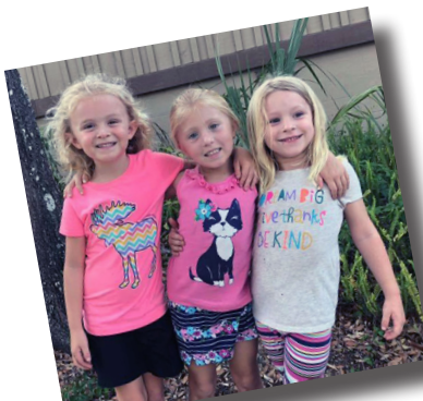
Youth, children and adults all relish the activities at Cedarkirk the weekend of April 14-15.