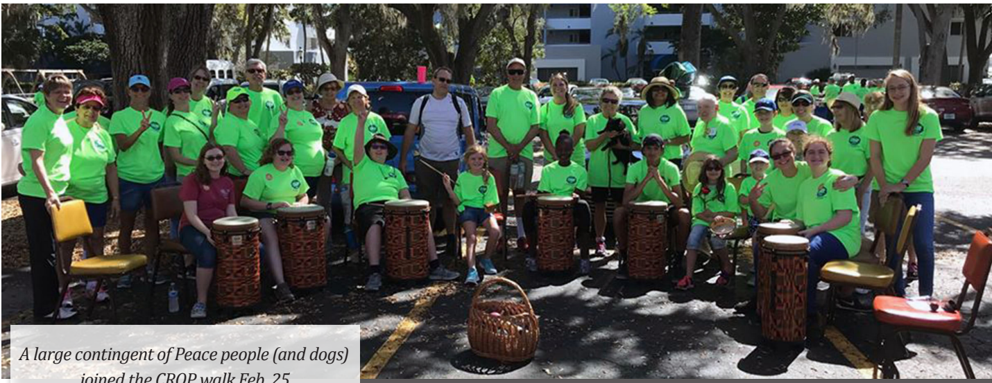
A large contingent of Peace people (and dogs) joined the CROP walk Feb. 25.