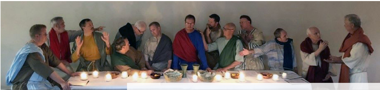
A Living Last Supper March 29 offered Peace an eye-witness version of Maundy Thursday.