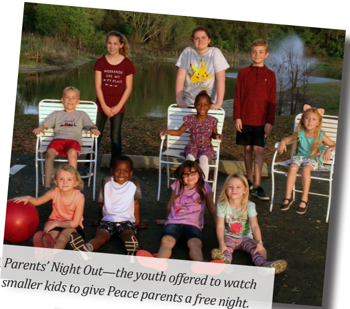
A Parents' Night Out—the youth offered to watch smaller kids to give Peace parents a free night.