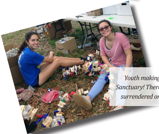
Youth making enrichment toys for Birds of Paradise Bird Sanctuary! There are over 300 exotic birds here who have been surrendered or rescued. It is a big job to care for these birds.