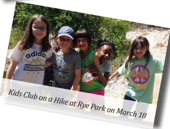
Kids Club on a Hike at Rye Park on March 18